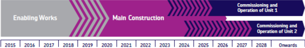
Figure 3: Indicative timeline and phasing of the Wylfa Newydd Project

similar timeframe), covering issues such as socio-economics, Welsh language, recreation, traffic and transport, noise, air quality, soils, hydrology, ecology, tides and sea currents, landscape and views. Information will be included on measures that we propose to reduce any potential adverse effects such as landscaping and the provision of new wildlife features and habitats. Our consultation information will also include details of the potential environmental and community benefits of the Project.