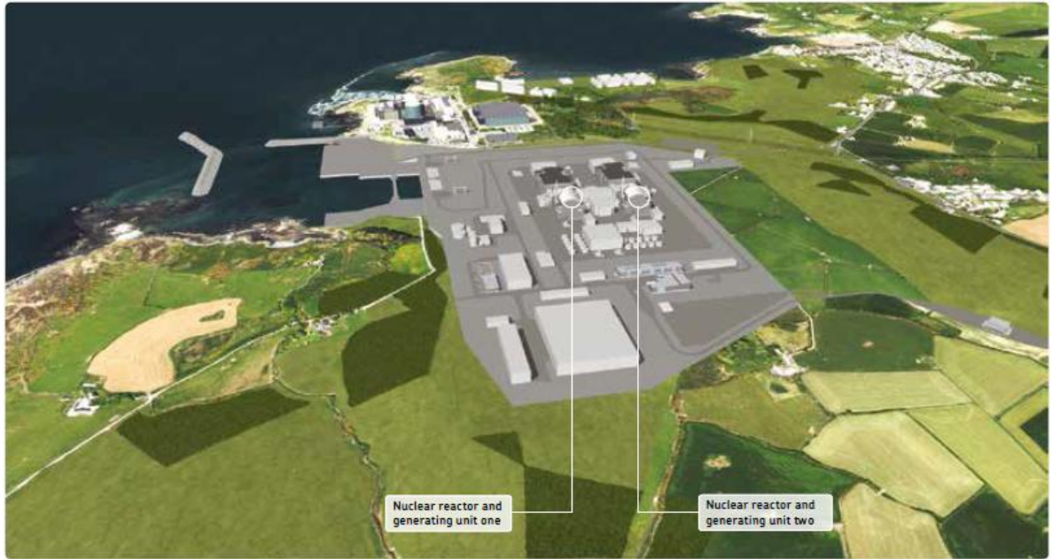
Figure 1: Indicative location of our Power Station