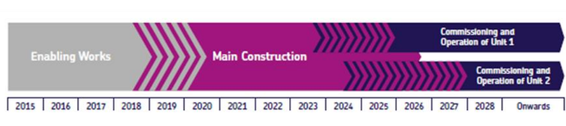
Figure 3: Indicative timeline and phasing of the Wylfa Newydd Project

We will include information on the potential community and environmental effects of the proposed changes, covering issues such as socio-economics, Welsh language, recreation, traffic and transport, noise, air quality, soils, hydrology, ecology, the marine environment, landscape and views. Information will be included on measures that we propose to reduce any potential adverse effects such as landscaping and the provision of new wildlife features and habitats. Our consultation information will also outline the potential environmental and socio-economic mitigation we will provide to reduce impacts on local communities and enhance the benefits of the Project.