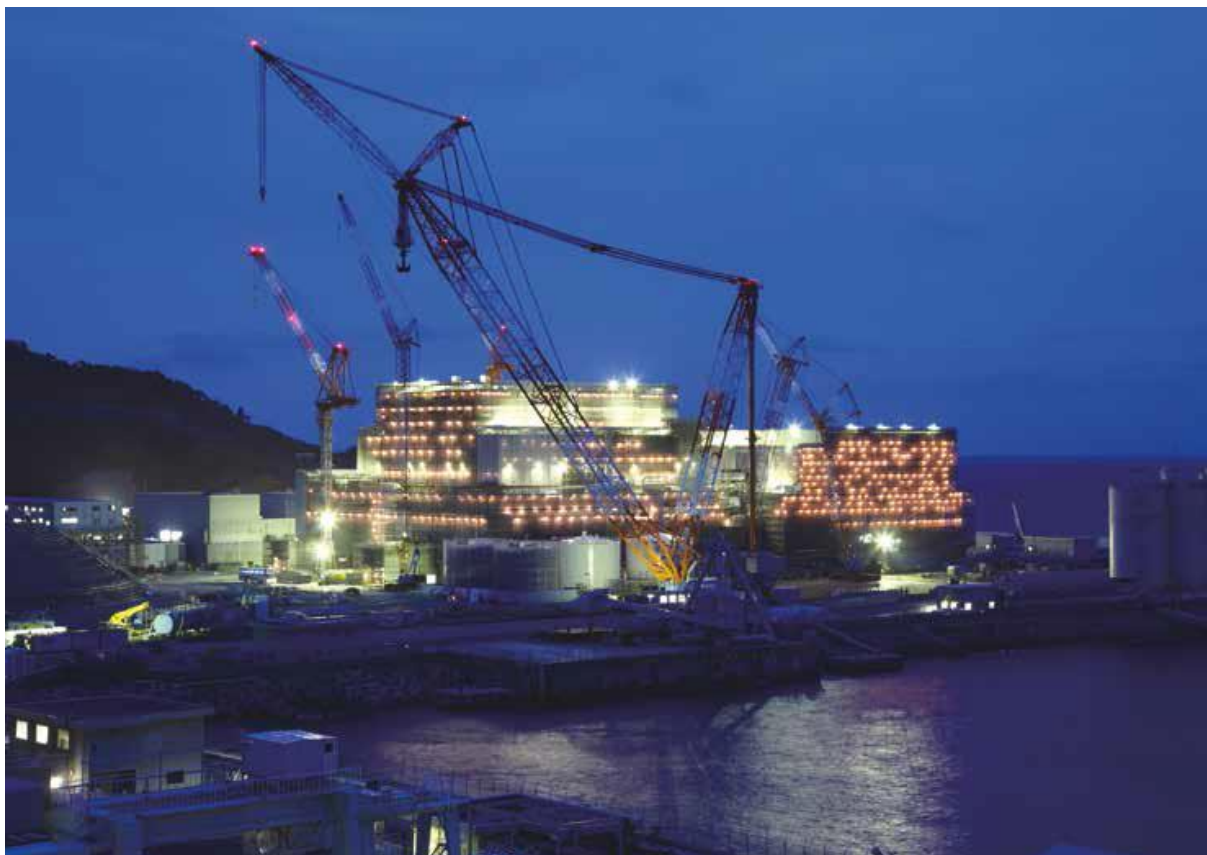
Figure 2: Construction of ABWR building at Shimane 3 in Japan

We have provided Preliminary Environmental Information (PEI) and updates to PEI during all our consultation rounds. In our third pre-application consultation we will be providing further updated environmental information, focusing on the effects of the changes to the Project.